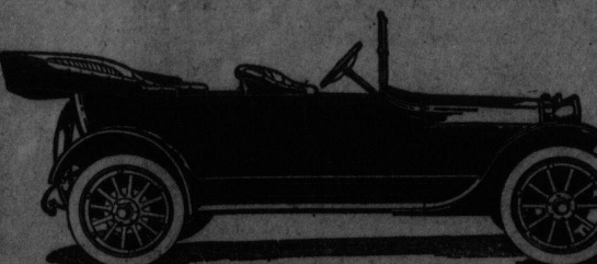
Russell Light Six $1750.

Oldsmobile, Russell, Cole and Paige Cars G. M. C. Trucks Maltese Cross Tires