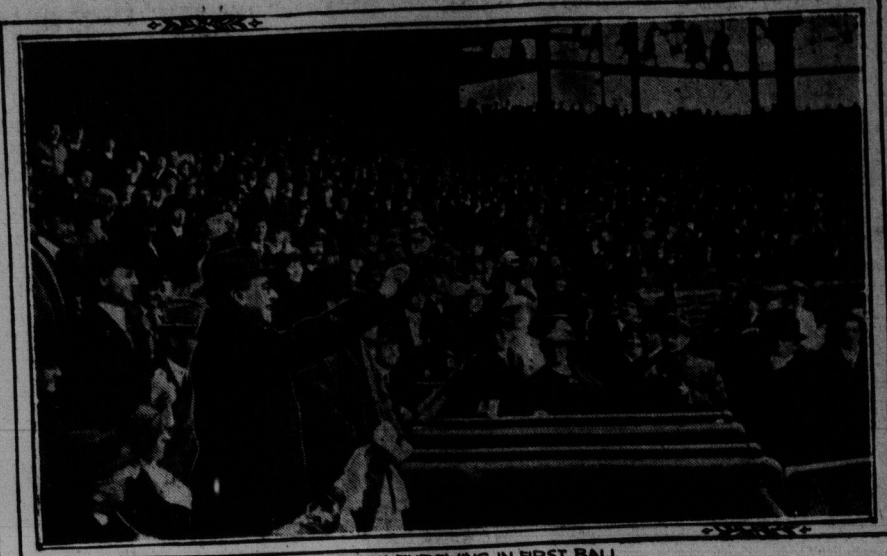
PRESIDENT WILSON THROWING IN FIRST BALL. President Wilson was present at the opening game of the American League, between New York and Washington, played at Washington. A monster crowd had gathered to see the first game and, amid loud cheering by thousands, the President threw the first ball in the game.