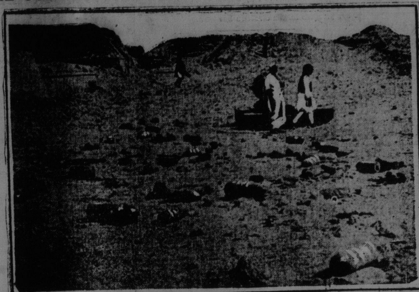
The ruin wrought by the Italian fire is shown in this photograph. Shells from the big Italian guns are seen strewn over the ground.