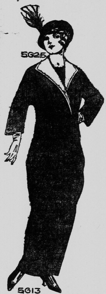
Summer suit in dark brown moire trimmed with buttons and an adjustable collar of bonneted linen.

Quant yet exceedingly attractive suits of moire are shown for summer wear, especially for use when traveling. The costume illustrated for today's lesson is carried out in dark blue silk, with trimmings of its own material. The collar is detachable and may be of any desired material. Nothing is smarter, however, than sheer white linen for this purpose. Four yards of 36-inch moire will be needed to make the suit.