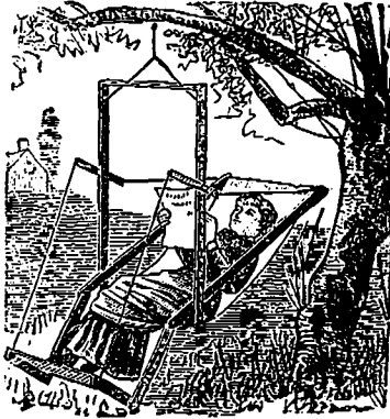
Our Automatic Swing and Hammock Chair