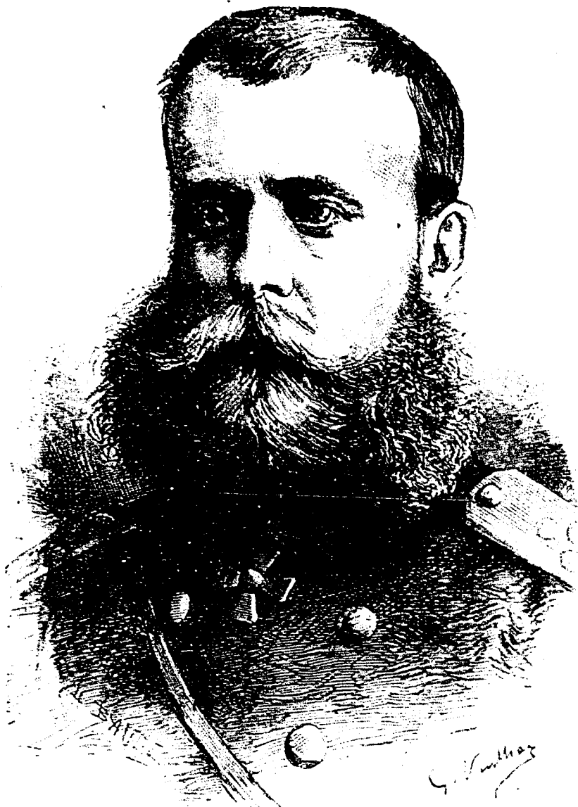
GENERAL MICHAEL DIMITRIEWITCH SKOBELLEFF.