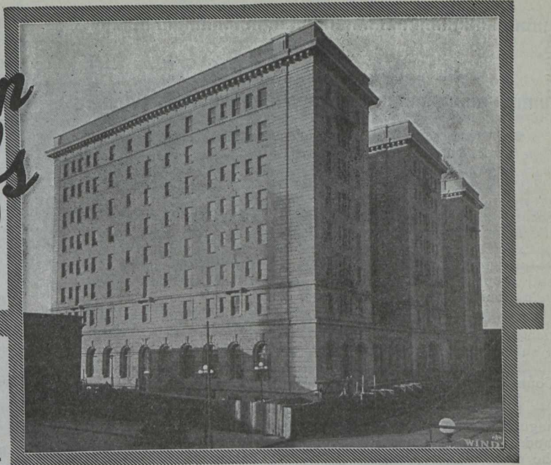
Canadian Pacific Railway Hotel, Calgary, Alberta.