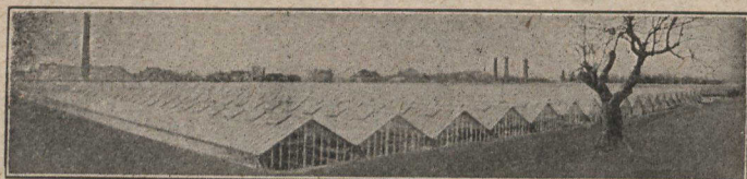
Conservatories of The Dale Estate, Brampton, Ont. Glass supplied by our Toronto Branch

GOOD QUALITY, FLAT, EVEN THICKNESS AND WELL CUT