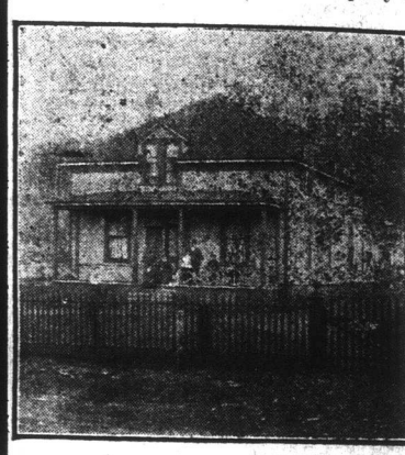
SUPT. GREEN'S RESIDENCE.

shading off into rich hur, which is "burnt" out of the use at Telegraph Bay is an ty here does for less than $100. on the de-nitrator the sulphuric acid. is now "itself again."