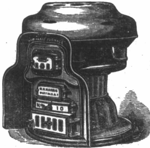
SEVEN SIZES FOR COAL AND WOOD