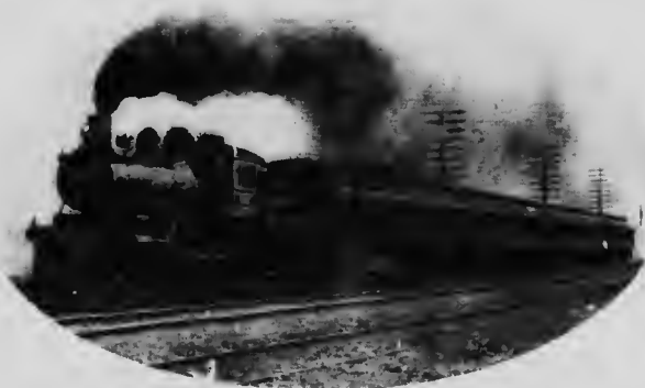
Empire State Express, Fastest Train in the World