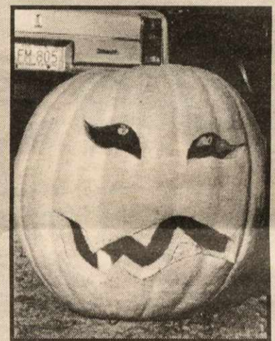
"Is that car backing up? C'mon, is it? Fucking kids. Are they backing up? I wanna go back to my porch. For fuck's sake. Are they backing up yet?" One sorry-ass pumpkin head, first, last and only year, Halifax NS