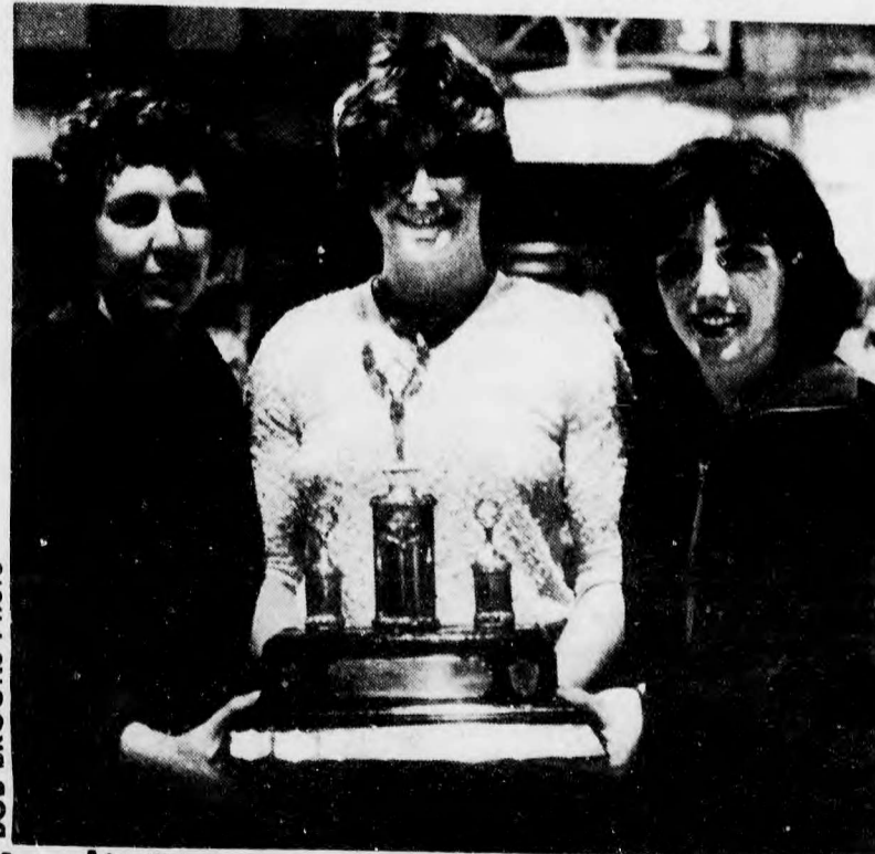
BOB BROOKS Photo