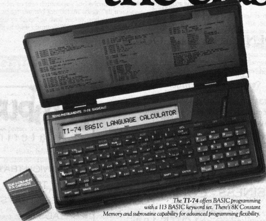
The TI-74 offers BASIC programming with a 113 BASIC keyword set. There's 8K Constant Memory and subroutine capability for advanced programming flexibility.