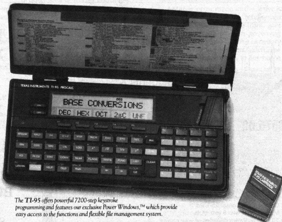
The TI-95 offers powerful 7200-step keystroke programming and features our exclusive Power Windows™ which provide easy access to the functions and flexible file management system.

TI programmable calculators have all the right functions and enough extra features to satisfy your thirst for power.