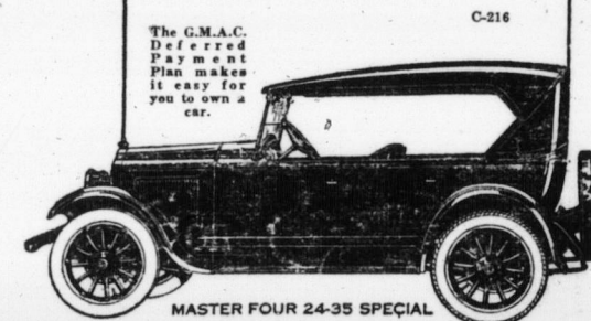
MASTER FOUR 24-35 SPECIAL