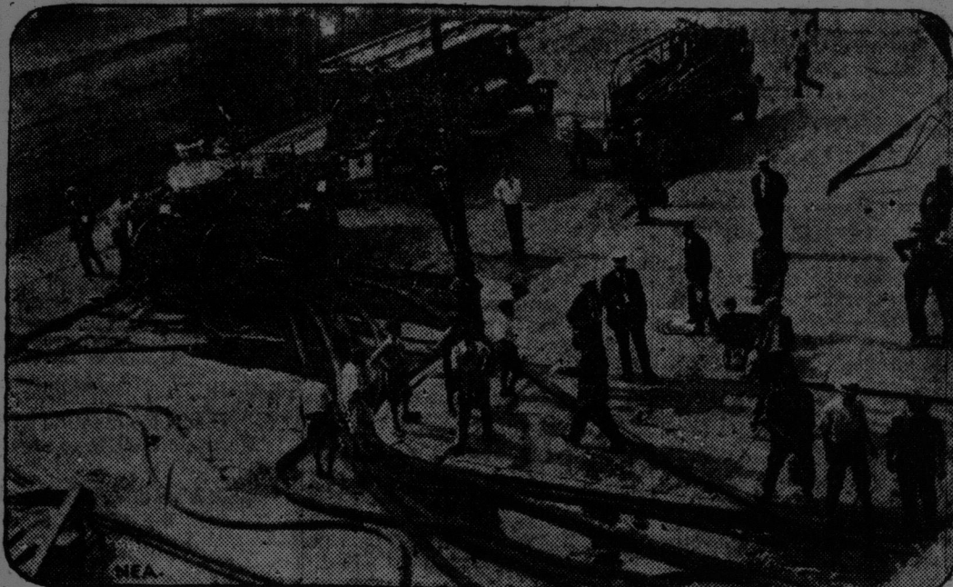
Broadway got good and wet and thousands of subway passengers were delayed for an hour or so when a water main burst under New York's famous thoroughfare. This picture shows firemen working to pump away the water from the subways.