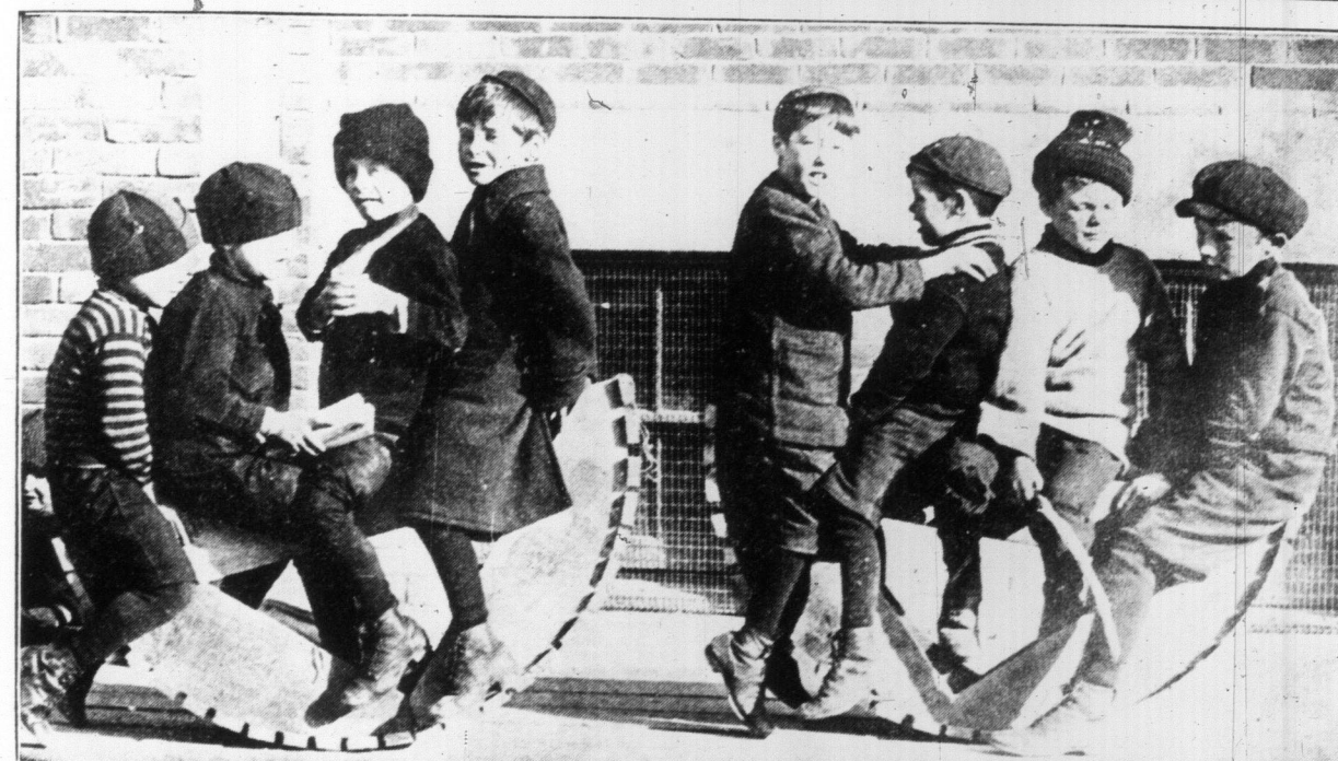
LEAVE IT TO THE SCHOOLBOYS TO FIND NEW IDEAS IN AMUSEMENT, ESPECIALLY WHEN BUILDING OPERATIONS ARE GOING ON.

ELLIS BROS., Limited, Jewelers 108 Yonge St. Open Evenings