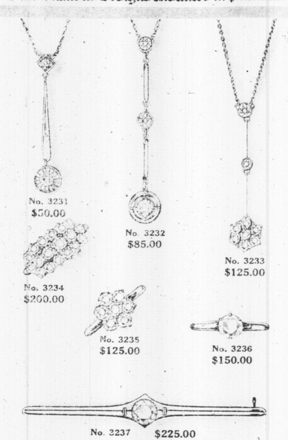
Fine Diamond Designs Mounted in Platinum

Our illustrations herewith give but an idea of the character of our selections, where Platinum—the metal so admirably adapted for Diamond Jewelry—shows to much advantage.