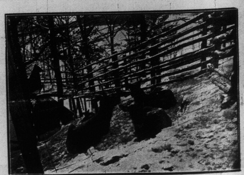
DREAMING OF SUMMER'S HAPPY BROWSING-TIME. Deer in High Park, after the first snowfall of the season.