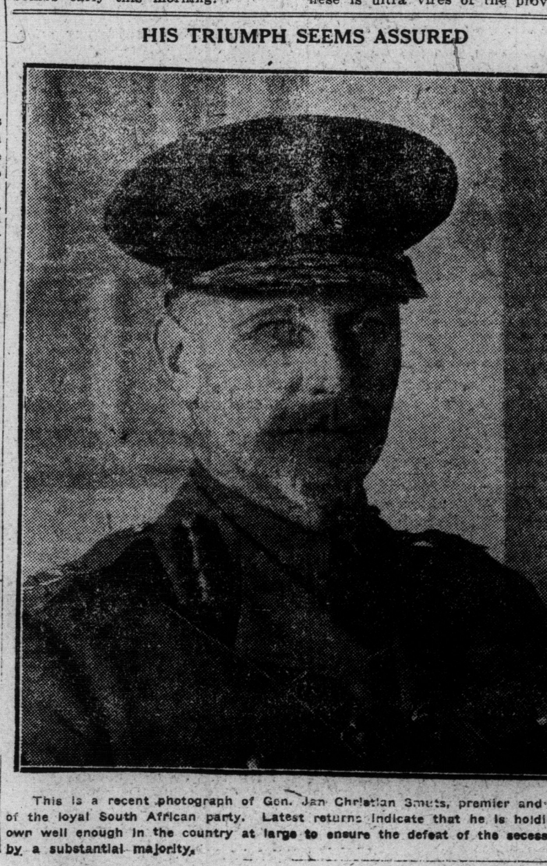
This is a recent photograph of Gen. Jan Christian Smuts, premier and leader of the loyal South African party. Latest returns indicate that he is holding his own well enough in the country at large to ensure the defeat of the secessionists by a substantial majority.

At the close of the meeting, no one seemed particularly anxious to leave the country without first giving careful consideration and counting the cost. The number of families affected in the new colonization scheme is approximately 500.