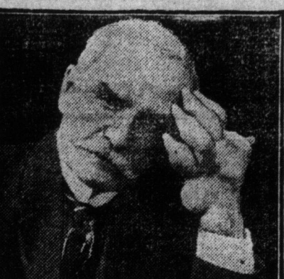
GIVE ME A CHANCE TO CUREYOUR RHEUMATISM FREE

Recruiting for overseas service reached an acute stage last night when all the overseas battalions yied with each other in strenuous attempts obtain and hold recruits. After violent contest, strengthened by number of men offering, the Irish Fusiliers easily topped the poll. The Fusiliers are after big fellows. They want a number of men over the six-foot limit. Already fifteen men topping the six-foot limit have signed up, but the Fusiliers want a whole platoon of big men. An officer, over the top limit is waiting, and he hopes that none above the height mentioned will overlook the Irish Battalion.