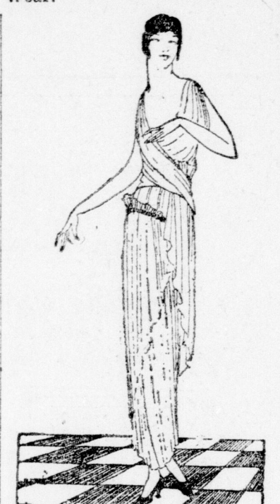
Evening Gown of Lavender Crepe, Laid Over Georgette.

An overskirt of lavender crepe starts at the centre front. It is gathered with a deep heading, and runs around the back in a bias line and again appears in front below the drapery of the bodice. This overskirt is a masterpiece of line.