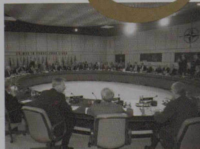
Canada, while remaining in NATO, now contributed less per capita than any other member country.