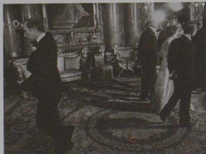
Prime Minister Trudeau performing his famous pirouette during a May 7, 1977, reception at Buckingham Palace in London, England