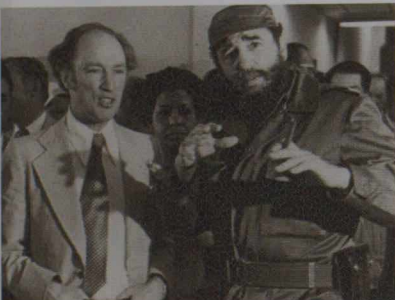
Prime Minister Trudeau and Cuban President Fidel Castro at a Havana housing project, January 27, 1976