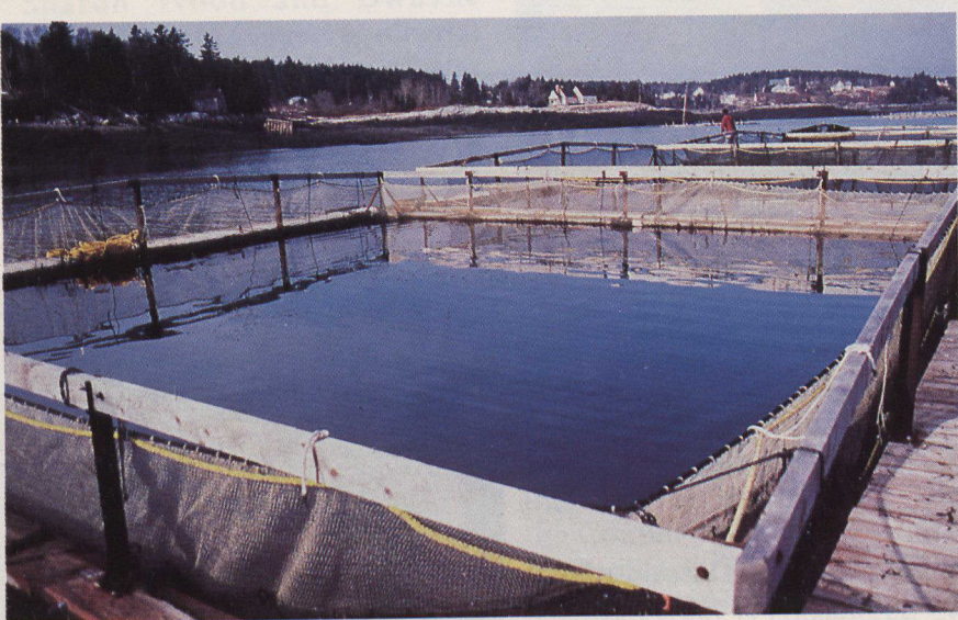
Atlantic salmon culture farm in New Brunswick.

Trout has been the most valuable species produced commercially in Canada for some time. Rainbow trout, farmed in all regions of Canada, is the most prevalent. Production of trout, both rainbow and brook, is expected to increase from some 1 800 tonnes in 1984 to 2 500 tonnes by 1990.