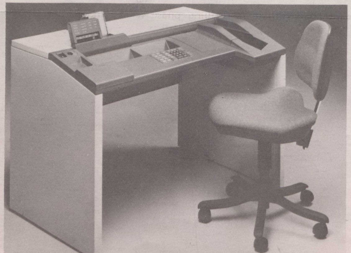
Single-pocket proof station is designed to reduce operator fatigue and maximize processing speed and efficiency.