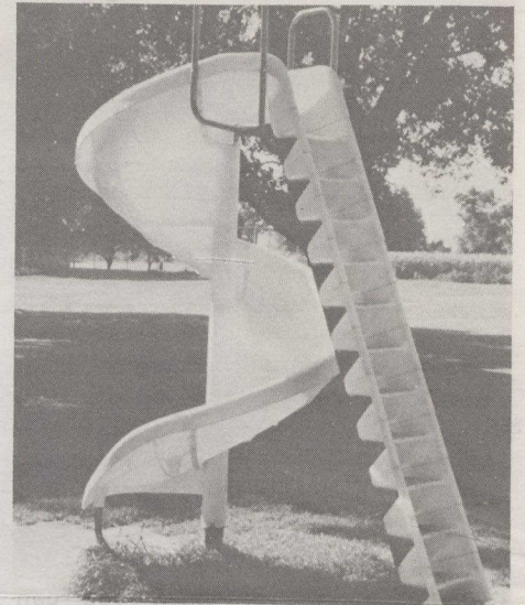
Duraglide spiral slide composed of moulded plastic modules is easy to package and ship.

The single-pocket proof station was invented by NCR Canada Ltd. The product's major application is bank docu-