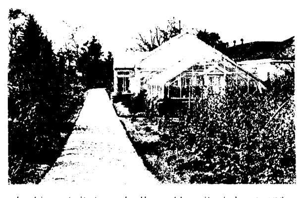
Looking at it towards the gables; its balance and attractiveness lose nothing.