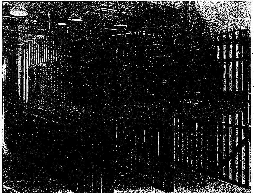
EMPLOYEES' ENTRANCE, GOODYEAR TIRE AND RUBBER COMPANY'S NEW FACTORY.