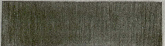
TOOLED FACE BLOCK