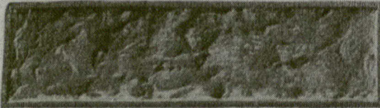
ROCK FACE BLOCK.

When corresponding with advertisers please mention the CANADIAN ARCHITECT AND BUILDER.