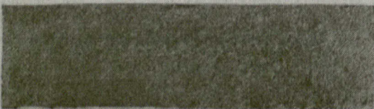
CROSS TOOTH CHISELED