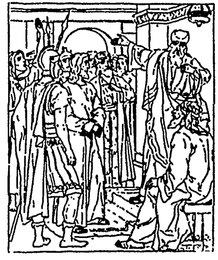
CHRIST BEFORE THE HIGH PRIEST.