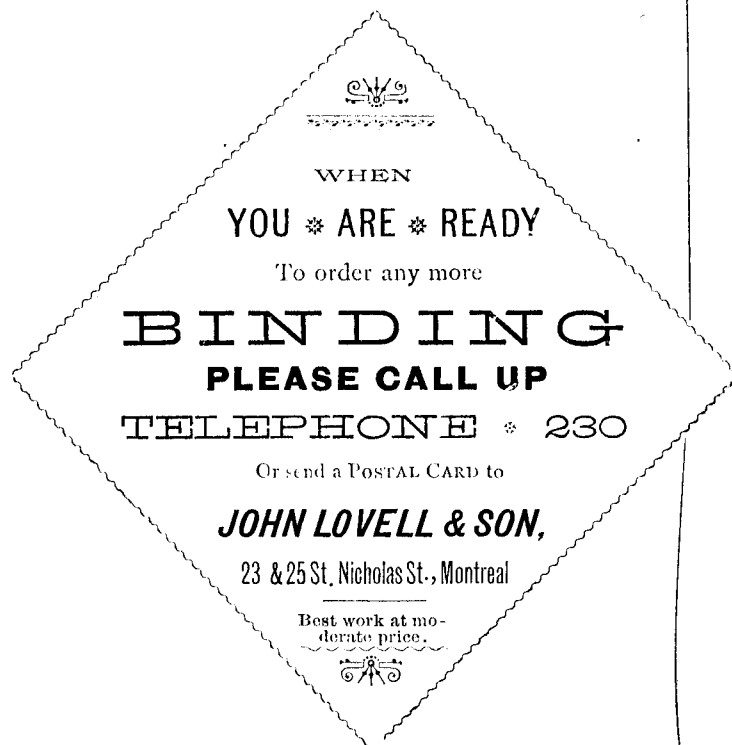
Photo - Engraving.

Zetland, Earl of, appointed Lord Lieutenant of Ireland.—May 29.