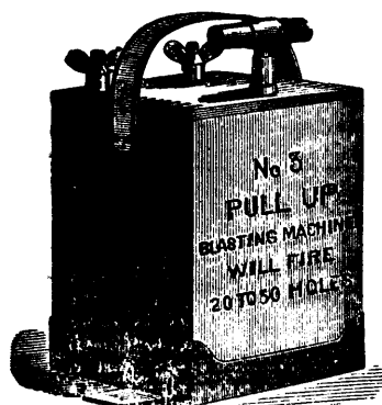
SEND FOR CATALOGUE.