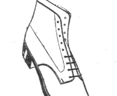
Pointed Toe; English Last. In Black and Tan Leather. $6.50.