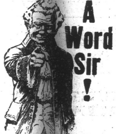
A Word Sir! These Shoes are the best for $6.50 in St. John's today, and represent the highest grade of Men's Shoes ever imported into Newfoundland.

High Grade Footwear for Little Money. Shoes you may feel proud to walk in. Your opportunity to select the Shoe of your heart for $6.50.