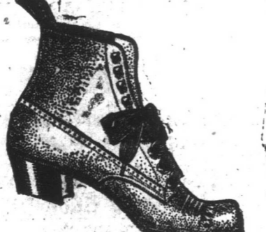
Genuine Tan Calf. Worth $10.00. Now $6.50.