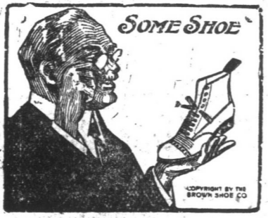
For $6.50. Black Leather; invisible eyelets.