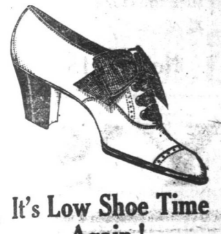
It's Low Shoe Time Again!

And many women are glad, because that means that there is nothing to prevent them from wearing the snappy Oxfords we are showing in many different leathers and styles. You will admire them. They are serviceable and reasonably priced, and some of the most comfortable footwear you can find.