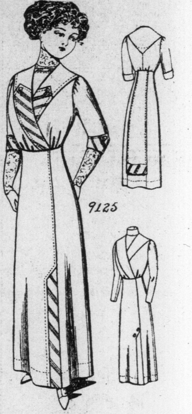
Ladies' Costume in One or Two Piece Style, with High or Normal Waist Line, and with Tuckers.

This design embodies a number of prominent desirable style features. The sailor collar trimming, in pointed outline, the broad front on skirt, and loose panel, together with the popular high waistline, are very effective. The Pattern is cut in 5 sizes: 34, 36, 38, 40 and 42 inches bust measure. It requires 6 1/8 yards of 44 inch material, 1 1/2 yards of 27 inch material for the tucker for the 36 inch size. A Pattern of this illustration mailed to any address on receipt of 10c. in silver or stamps.