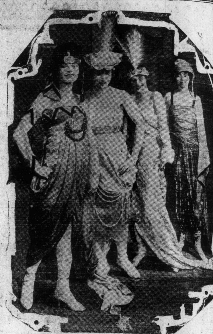
One of the magnificent and costly fashion plates ensembles in John Cort's brilliant musical comedy offering Flo Flo coming to the Grand.

No more medicine for the stomach that isn't where your cold is lodged. Just breathe in the healing vapor of Catarrhazone—a soothing healing medication that acts instantly. Colds, sore throat and catarrh fairly flee before Catarrhazone. Every spot that is congested is healed, irritation is soothed away, phlegm and secretions are cleaned out, and all symptoms of cold and catarrh are cured. Nothing so quick, so sure so pleasant as Catarrhazone, so beware of dangerous substitutes meant to deceive you for genuine Catarrhazone. All dealers sell Catarrhazone, large size, which lasts two months, price $1.00; small size, 50c. sample size, 25c.