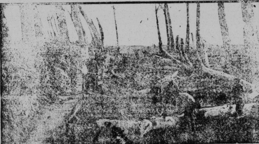
On the British Front in France.—Everything at the front is put to some use. These trees are being used for road-making and strengthening dug-outs.