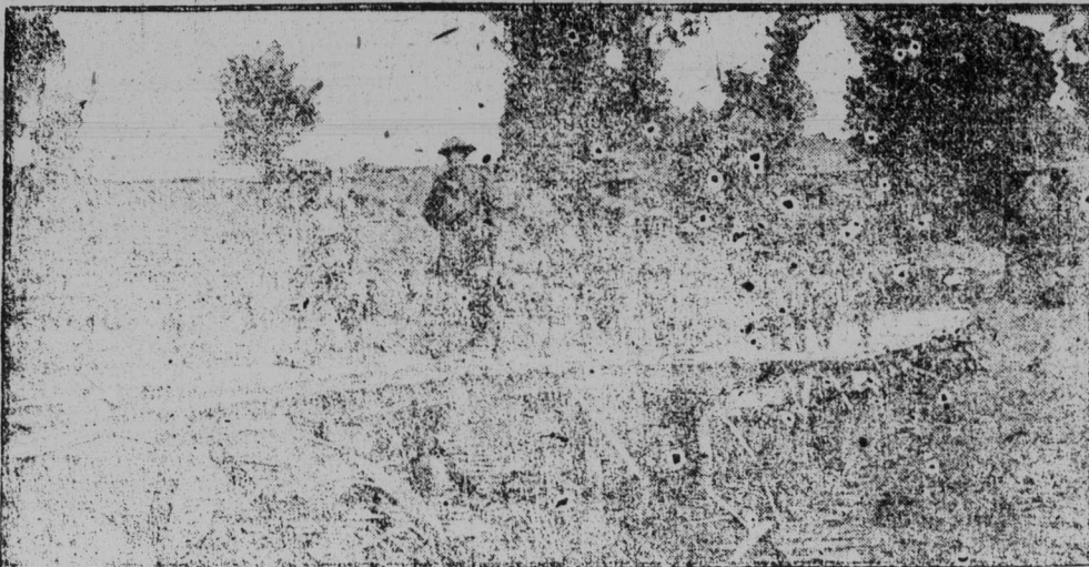
Battle of Menin Road.—Infantry crossing the stream after having driven the Hun back.