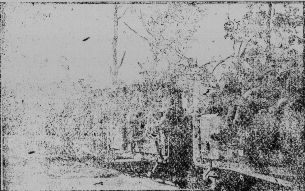
Welsh battalions being conveyed to the front.—They fought magnificently in the storming of Zonnebeke—gaining a line of their objectives.