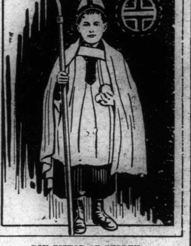
BOY BISHOP OF BERDEN.