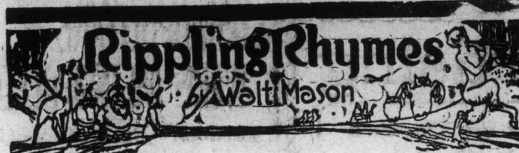
SIGNS OF SPRING.