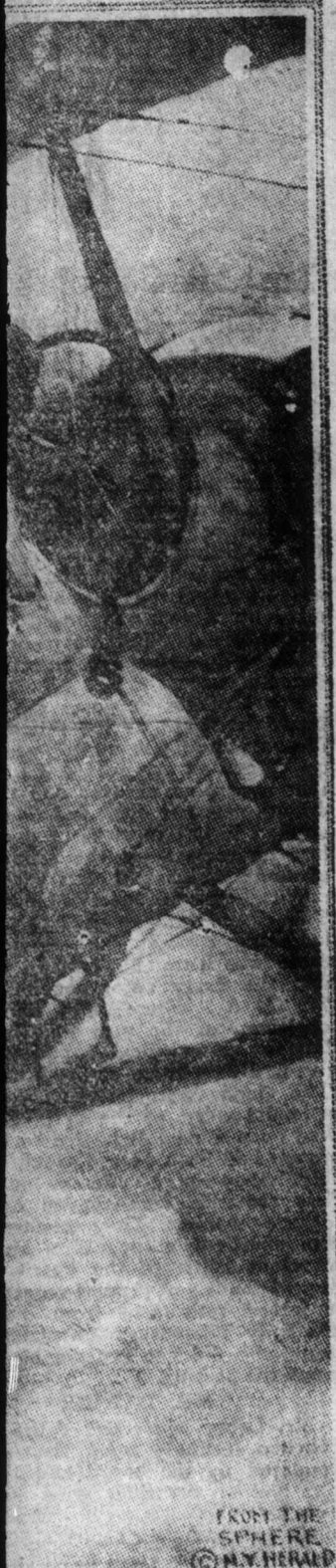
FROM THE SPHERE BY N.Y. HERALD