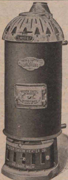
THIS IS THE KIND

N. J. HOLDEN & CO., Agents, 302 St. James St., MONTREAL