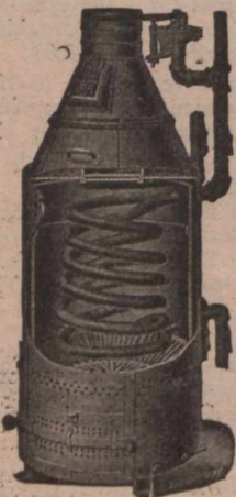
Double Coil Jointless Fire-proof Steel Heater

The only Fire-proof and Break-proof Heaters on the market, made of \frac{1}{4} in. jointless steel casings. Single and double coils. Steam Attachments to circulate the water of the Baker Heater by steam from the locomotive; or will circulate hot water independently of any Heater. Pipe and pipe fittings for Baker Heater work. Especial attention is called to our Heater for Electric cars.