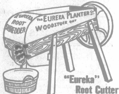
"Eureka" Root Cutter

Things you need—implements and tools that should be on every truck garden and farm. Our way of making these specialties assures adaptability, strength and service at the minimum price for the best goods of their kind on the market.