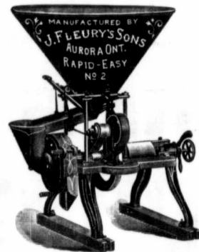
Fleury's "No. 2 Rapid Easy."

The "No. 2 Rapid Easy" with 10-inch plates, and its SOLID FRAME or BED, is not only an extremely handsome looking machine but the character of its work and its great capacity make it one of the best "paying guests" on the farm. Feed trough is long and broad giving feeding and screening capacity equal to the rapid work of the grinder.