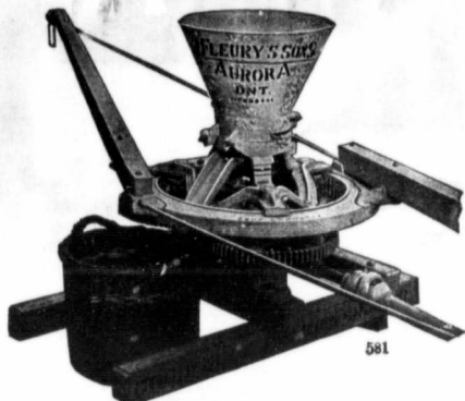
'Good Luck' Power with Grinder Attachment

As a power for driving any machinery with two or four horses the "GOOD LUCK" Triple Geared Power is unequalled. The above machine, set up with Arms and Tumbling Rod ready for horses and to drive another machine by rod direct, will be found one of the best time savers and effective dual-purpose machines now in use. The construction and finish are perfect. Thousands of them are now in active service and giving the highest satisfaction. A machine of highest capability.