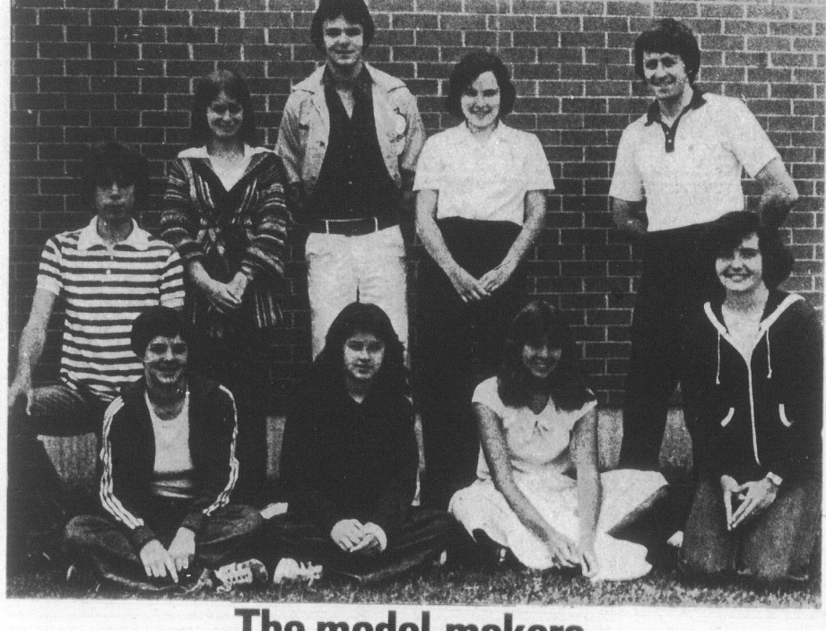
C12 - The Mississauga Times, Wednesday, July 5, 1978