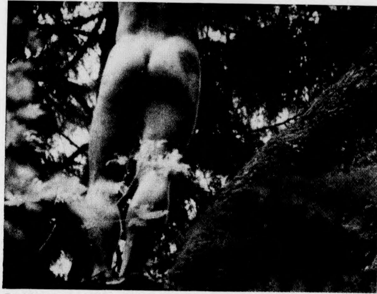
Buddies in Bad Times Theatre attempted to break down the fourth wall between the audience and the action of the play.

scene was really liberating" for the primarily white, gay, male audience. They identified strongly with the exposure of a hypocrisy when the