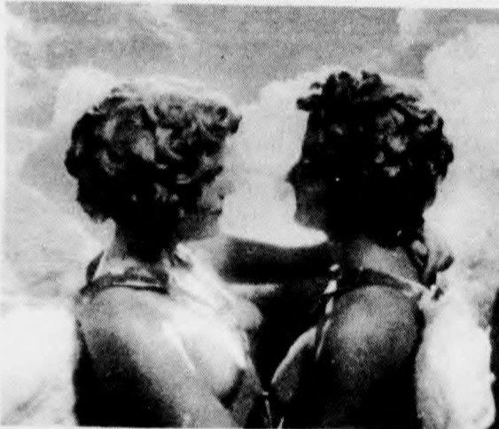
In Rosebud , a young artist uncovers new desires after getting off on watching a lesbian couple do it.

So where and when would one expect to find these lesbi-friendly films, now that the brief ten-day fest is over? Some are available on video at the National Film Board's film/video library. Others will be included in this spring's Lesbian And Gay Film festival. Some might make it to revue theatres. It's discouraging that mainstream audiences may never get to see these entertaining, informative films in a commercial feature length format. But many are worth seeking out.