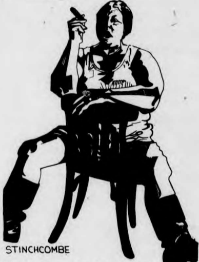
STINCHCOMBE Wertmuller double bill Saturday presented by Bethune Movies.

Today, 7 p.m. - Clint Eastwood Film Festival - A Fist Full of Dollars, For a Few Dollars More and The Good, the Bad and the Ugly - admission $1.99 - L, Curtis 7:30 p.m. - Film (JSF, Student Zionist Organization) The Fixer - F, Stedman