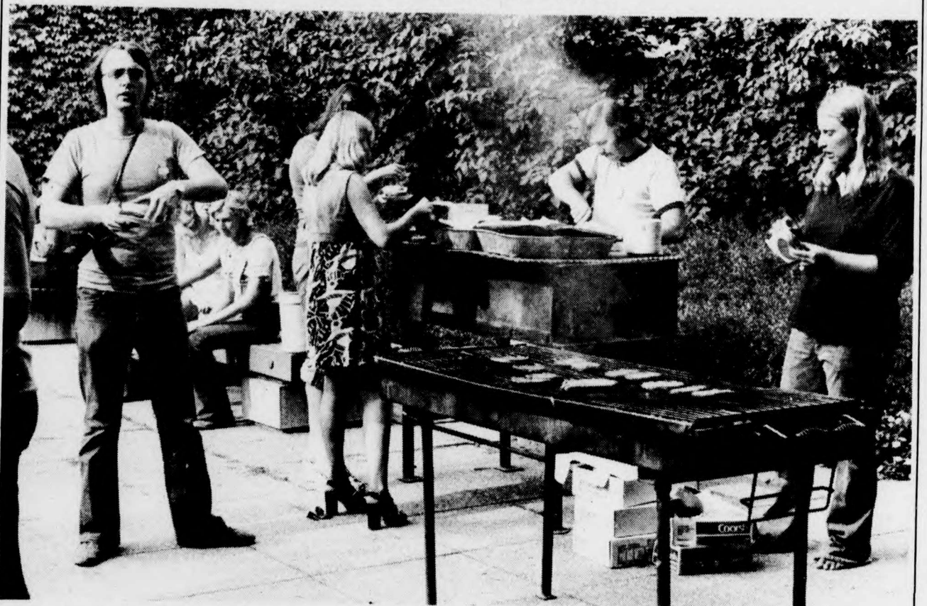
Following the early morning disappearance of a resident student near the barbecue, diners noticed a strange after-taste in their burgers.