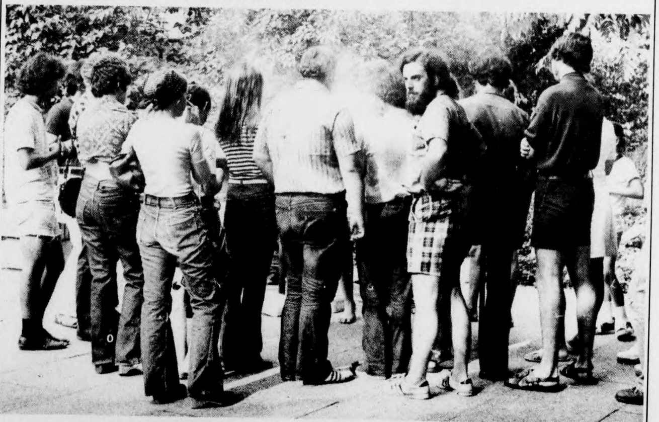
In protest against the new voucher system introduced in Versafood cafeterias, angry students set fire to "funny money" coupons.