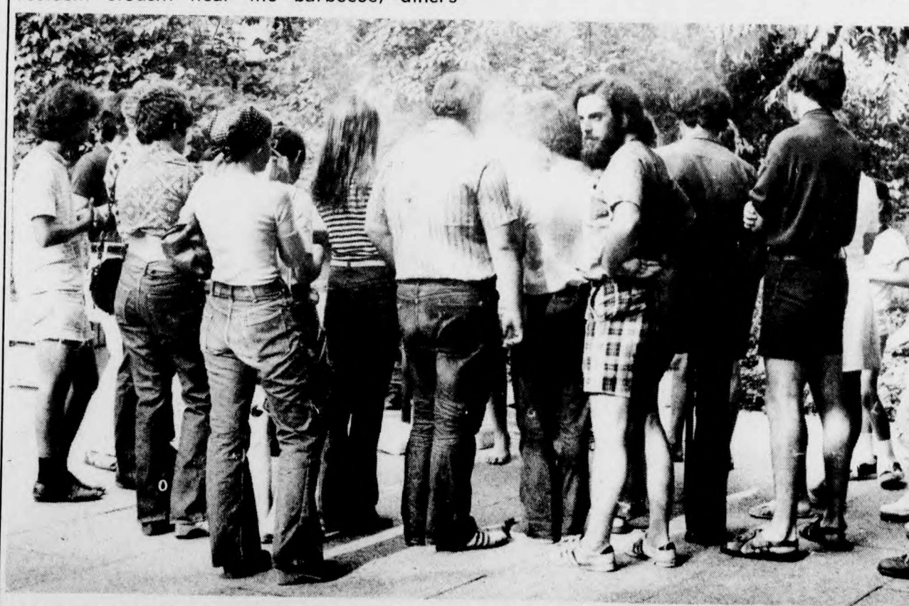
In protest against the new voucher system in- set fire to "funny money" coupons. troduced in Versafood cafeterias, angry students