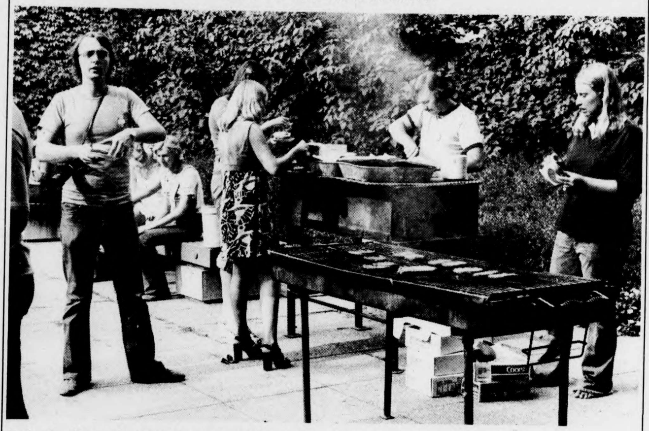
Following the early morning disappearance of a noticed a strange after-taste in their burgers. resident student near the barbecue, diners