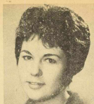
BEAUTY . . . . and the BEAST