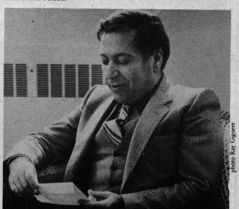
Saudi Arabian money is injected into U of A Middle East studies