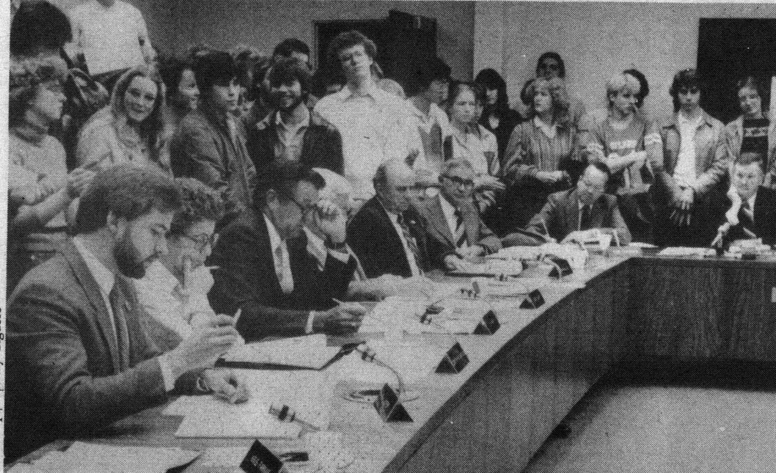
Board members pass indexing proposal with students as witnesses.