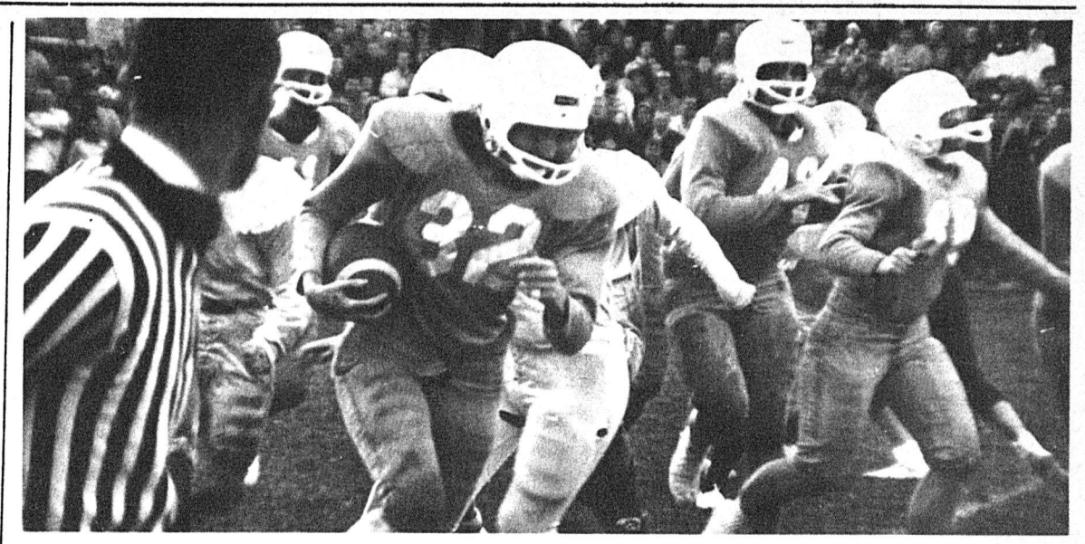
HERE I COME!!!—Unknown fraternity ruffian carries for short yardage in halftime football

- Emergency Service Monday through Saturday -Convenient Parking