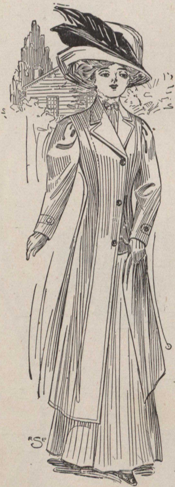
G100 —A Smart Knockabout Coat, \frac{7}{8} length, imported English tweed, nice soft finish, good weight, tailored pleat each side of coat on front, mannish collar, with square back, wrist with band and button, fastened with 3 buttons, and flaps to pockets. Colors of grey or green mixtures. Sizes 32 to 42..... 5.95