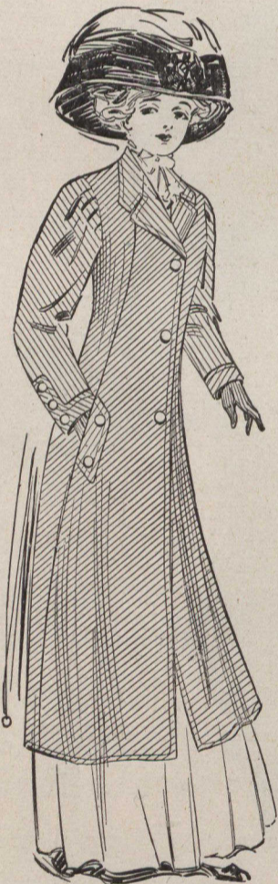
G200 —A good up-to-date Coat, on stylish and attractive lines, \frac{7}{8} length, made of wide wale serge, semi-fitting style, strapped pockets, plain tailored collar, fastened with three buttons on front, color a good medium grey, sizes 32 to 42..... 5.95